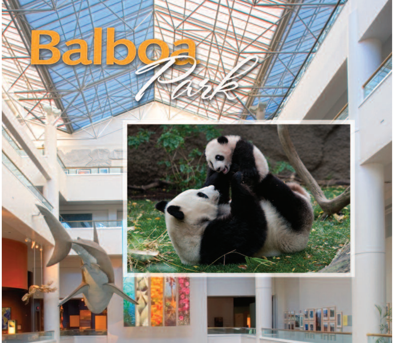
Balboa Park is home to the San Diego Zoo and world famous San Diego Natural History Museum with its hanging mobile displays and traveling exhibits under their stunning skylight.

Romantic Balboa Park is the nation's largest urban cultural park consisting of a forest of exotic trees, well-kept gardens, and a majestic lily pond, which is the most photographed site in the park. Here too is the renowned Old Globe Theatre and 15 outstanding must-see museums, art galleries and one of the largest planetariums in the entire country. It is also the home of the world famous San Diego Zoo.